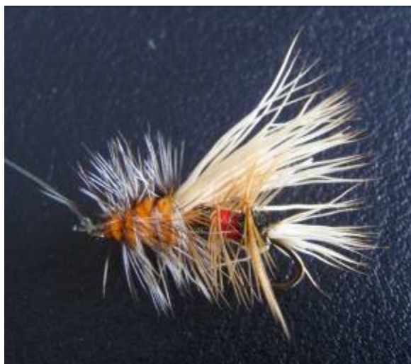
A popular attractor patter