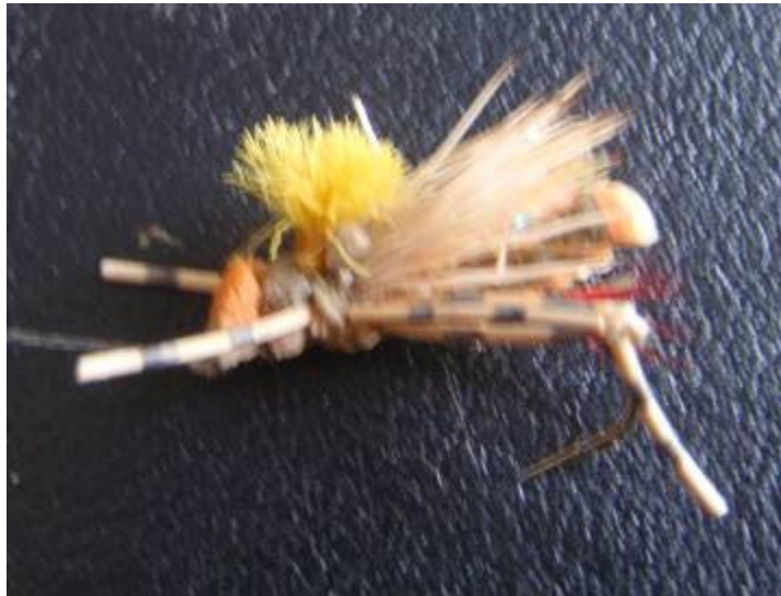
A small hopper pattern

Later in the evening the mayflies have been everywhere, and most of the lighter coloured patterns have been working well. Small hopper patterns are also still going well.