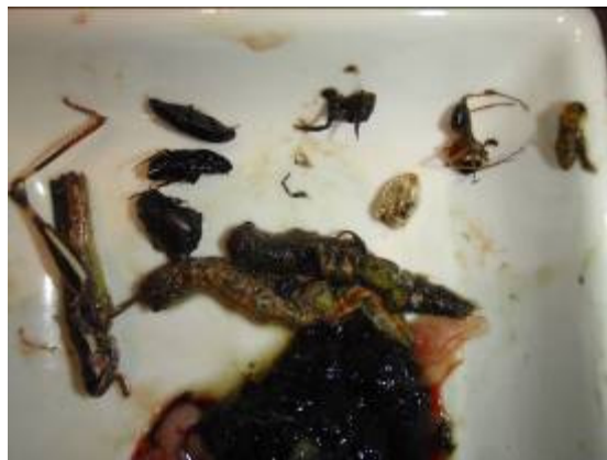
The stomach contents of an unfortunate trout