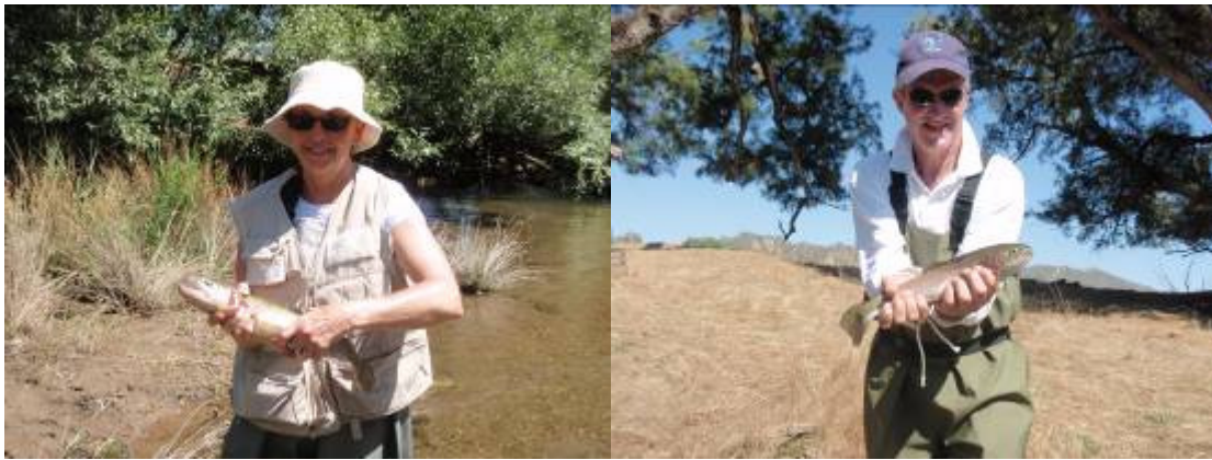
A couple with some excellent fish!