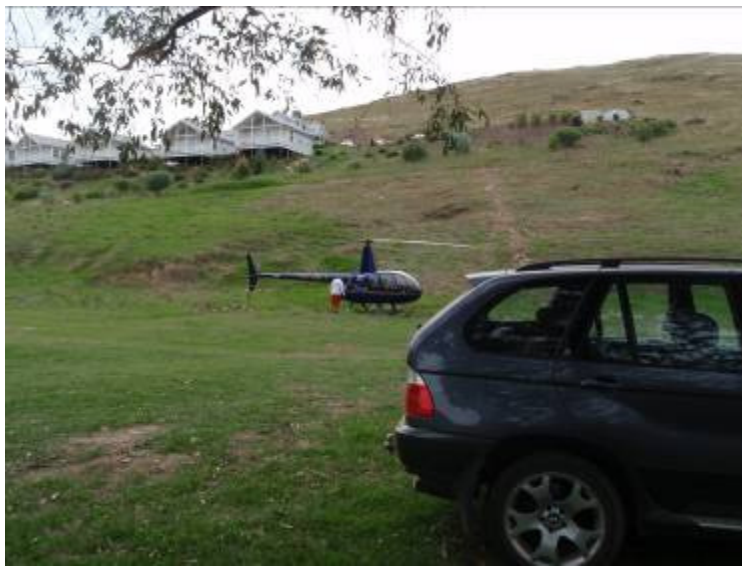
Some recent guests arriving by chopper